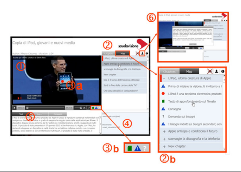
Fig. 2 - The player interface and its main characteristics

All of the hypervideos are collected in an online repository (a Web portal; see Figure 3), where it is possible to share them, given that copyright laws are respected. Any actor involved in VET (e.g., teachers, instructors, in-company trainers, exam experts, representatives of corporate associations) can subscribe the service completely for free. When creating a user id, an applicant has to sign an agreement, in which she/he is mainly asked 1. to personally take responsibility for ensuring that copyright laws are respected (if using existing videos); 2. to renounce any copyright proceeds (if using self-made videos); 3. to be willing to share any materials produced with the VET educational community; and 4. to ensure that she/he will only use the hypervideos for training and teaching in VET, and in no way for personal profit in or out of the VET system. Once teachers have registered with the portal, they will then be able to search for existing resources, not only to reuse them as they are, but also to adjust and re-structure them for compliance with their own needs. The portal will also allow teachers to manage their classes, to create online sessions with their pupils and to give pupils the opportunity to comment and tagging hypervideos while streaming them.