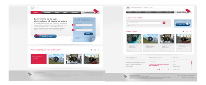
Fig. 3 - The Web portal entry (left) and home page (right)