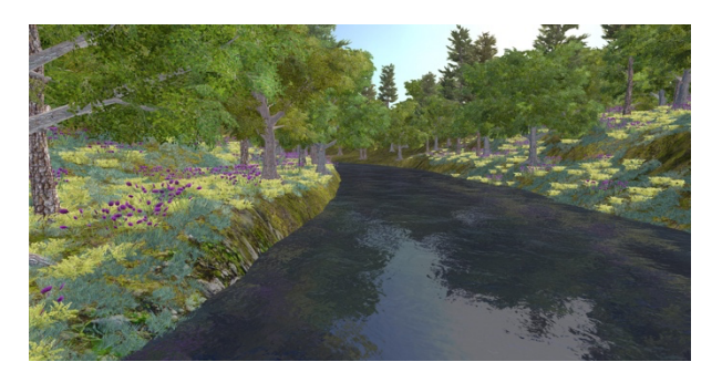
Figure 1 - A reproduced 3D VR scene of a fluvial reach.

• Competence - Learning to accurately and autonomously apply the standard measurement methods and methodologies in a real fluvial environment, with the possible support of innovative technology.