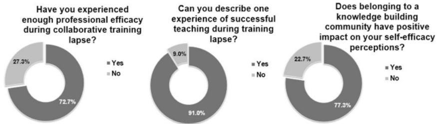
Fig. 2 - Impact factors on self-efficacy and active teaching

in the emerging field of technology innovation (68.2% cautious innovator; 31.8% innovator; 0% sceptical); respondents' main concerns in engaging in the experimental training, which lays with prior knowledge and skills (45%); positive contribution of the training to bring awareness to teachers' internal resources and/or limits (95%); experiencing cooperative approaches and interaction in Cloud based environment across training lapse as positive impact factors on innovation (86.4%). 91% of participants were able to describe one experience of successful teaching in which they had been involved during training lapse (narration) and most of them agreed that belonging to a knowledge building community has positive impact factor on perceived self-efficacy (fig. 2).