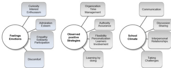
Fig. 4 - Synthesis of debriefing, based on group grids concerning vicarious observation

From observation, we register regular interactions of participants on Google Classroom and Google Groups, especially in the aim of accessing materials, arranging group work or asking for explanations; regular (individual and group) task delivery on the educational platform. From self-reported feed-back and peer interactions we notice initial resistance to task-based activities and growing openness and confidence within the training progress. Monitoring of vicarious observation (self-reported, assessment of the experience grids) returns teachers' feelings and attitudes about those activities. In specific, curiosity and desire for new practices is sometimes counterbalanced by puzzlement and discomfort in peer observation, which is perceived by a tiny sample as an evaluative judgment on colleagues' job, rather than a form of observational learning (fig. 4).