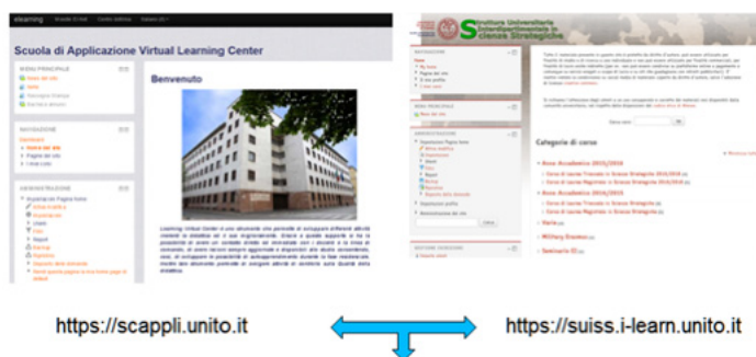
Fig. 1 - A screenshot of the two moodle platforms

those courses involving mixed civil-military enrollment, such as the Military Erasmus. The SCAPPLI platform maintains the accreditation of users without University credentials, where the responsiveness ensures a quick and fast response, especially for teaching activities involving students from other Italian and foreign universities and academies. Numerous collaborations with various training institutes from EU Member States have been facilitated by providing these virtual environments. Splitting the management and the support tasks on the installed hardware, Help Desk tools and content production guarantees the functionality of both Moodle instances and the correct relationship with the different users ( Phase 2).