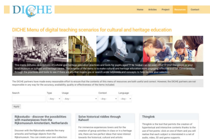
Fig. 1 - The menu of teaching scenarios of the DICHE project.

best practices and education tools for teachers.