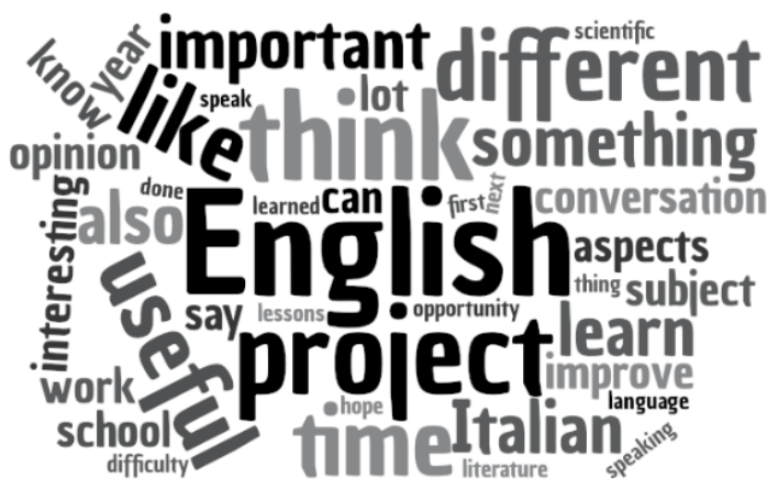
Fig. 2 - Word Cloud of participant feedback

Learner feedback on the course was collected from 14 students. Hand-written, anonymous responses to the question “How was this experience? (include positive and negative aspects)” were typed and aggregated to form a 988-word corpus. The Word Cloud in Figure 2 represents the terms used at least three times in this small corpus 5 .