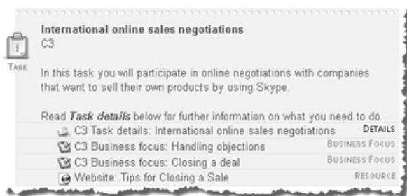
Fig. 1 - An oral interaction task from module C on the VLE

A questionnaire on self-assessment concluded each module, asking learners to reflect on their learning progress, problems and personal goals for the next module. Furthermore, learners evaluated their own proficiency by considering “can-do” statements inspired by those developed by the Association of Language Testers in Europe (ALTE) 8 as an appendix to the CEFR (cp. Council of Europe 2001). Learners were also asked to reflect on the group dynamics of the company team, and to estimate the value of their own contribution.