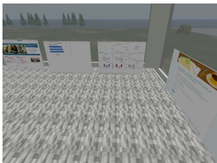
Fig. 2 - Simulator’s activity accessed from an in-world media panel