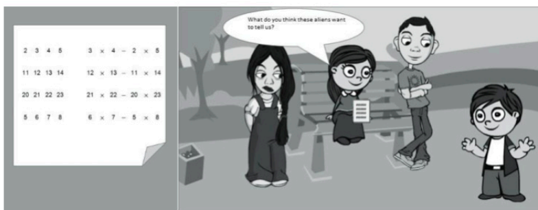
Fig. 1 - The user interface and the mathematical problem.

All teaching activities take place within a narrative framework, in a situation that can be engaging and familiar to the student. The setting of the story is science fiction where a group of four friends find themselves communicating with aliens, from whom they receive mysterious messages made up of numbers and mathematical operations (as shown in Figure 1).