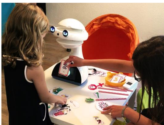
Figure 1 - EMYS robot teaches children new languages.

corresponding meaning to their mother tongue to check the extent to which they had acquired the L2 and preserved its terminology. Besides, the time invested in L2 learning by each child was calculated.