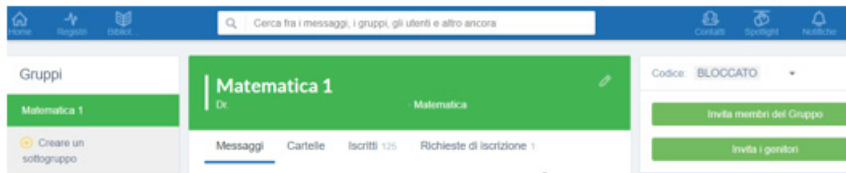
Fig. 1 – Homepage of Edmodo group of Calculus 1

Visually it has a central space where messages appear, enclosed between two service panels on the right and on the left, as in fig. 1.