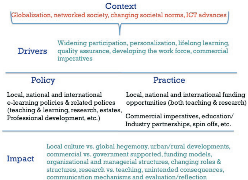
Fig. 1: The relationship between context, policy, practice and impact

Figure 1 provides a summary of these factors considering them in relation to wider contextual factors, specific policy and practice directives in different regions, and consequential impact in practice. It illustrates how the macro contextual factors influencing society generally (i.e. globalization, an increasingly network society, changing societal norms and values and technological advances) provide a contextual force and influence local policy and associated practices and how these in turn result in the ten types of impacts on practices listed above.