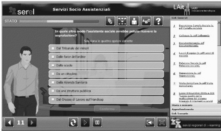
Fig. 1 Example of decision-making moments, based on a questionnaire