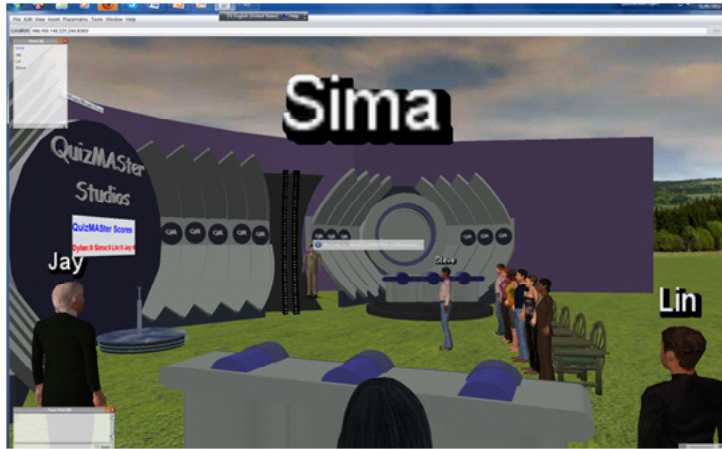
Fig. 1 - QuizMAster.

The main objectives of the student models in QuizMAster include helping the pedagogical agents select the adequately challenging questions for each game as well as helping them to match students with similar knowledge level to compete against each other in one game, helping the pedagogical agents pick the informative feedback to be provided to the students at different stages of each game show, and creating a personalized environment for each contestant based on their characteristics and preferences.