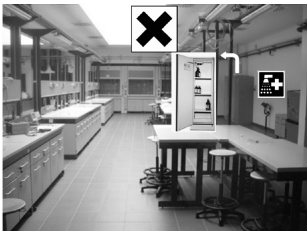
Fig. 2 - The student must also be trained with multimedia instruments to guarantee safety in a dangerous environment like a chemistry laboratory.

In particular it is, therefore, necessary to focus students' attention on their workplace with multimedia tools such as photos and films which can show the entire structure, the technical furnishings, the instruments and substances that will be used for the experiments. Particular attention has been given to creating the films (produced in collaboration with technicians from the Quazza multimedia laboratory to create high quality multimedia materials, http://www.labquazza.unito.it/ ) in which the main operations to perform in the laboratory are carried out and discussed by the teachers themselves.