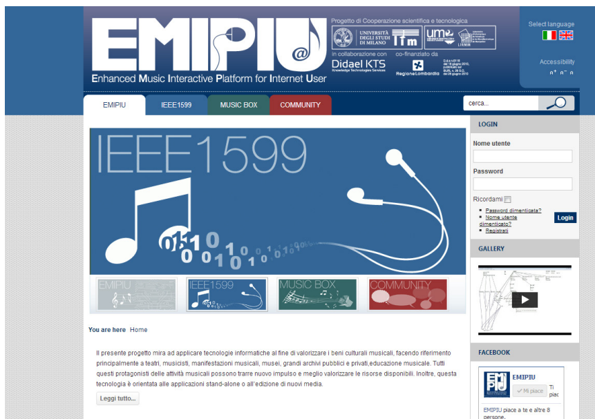
Fig. 4 - The homepage of the IEEE 1599 dedicated portal.

The portal includes general information, official documentation and a community area to exchange opinions, share materials and request clarifications on technological issues. For our purpose, the most interesting section is the Music Box , namely a media player that implements in a Web environment all the features of the format previously described.