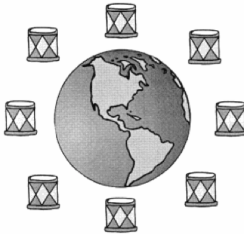
Fig. 3 - A music map for rhythmic notation.

Many other alternative score representations have been proposed. For example, (Nijs & Leman, 2014) describes the Music Paint Machine, an interactive system that translates music and movement into a creative visualization. In some pedagogical experiments, even Lego blocks have been used to represent rhythm (through block size) and pitch (through block color).